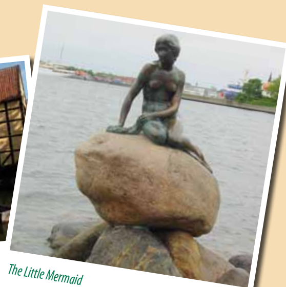
The Little Mermaid