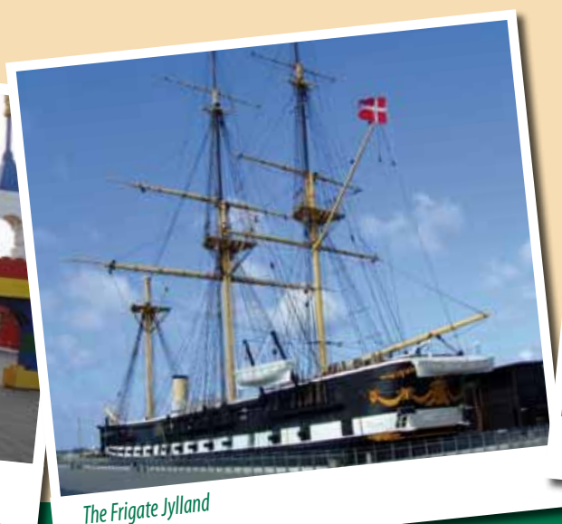
The Frigate Jylland