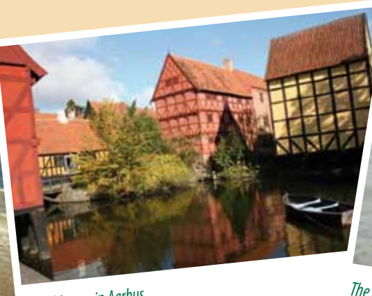
The old town in Aarhus